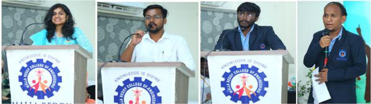
Patriotic speeches by students

The Independence Day celebration was unique this year in the sense that apart from the Principal and Vice principal, quite a few students also made their speeches on the occasion. The students on the whole expressed their keenness to pursue the path that would lead their motherland to prosperity.