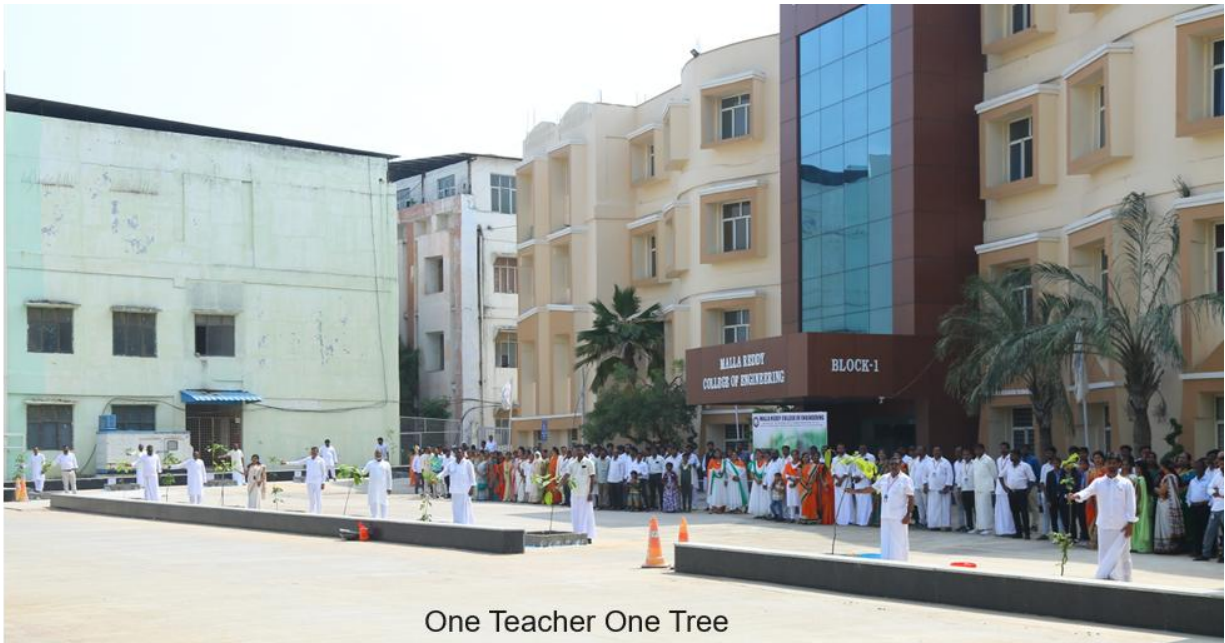
One Teacher One Tree