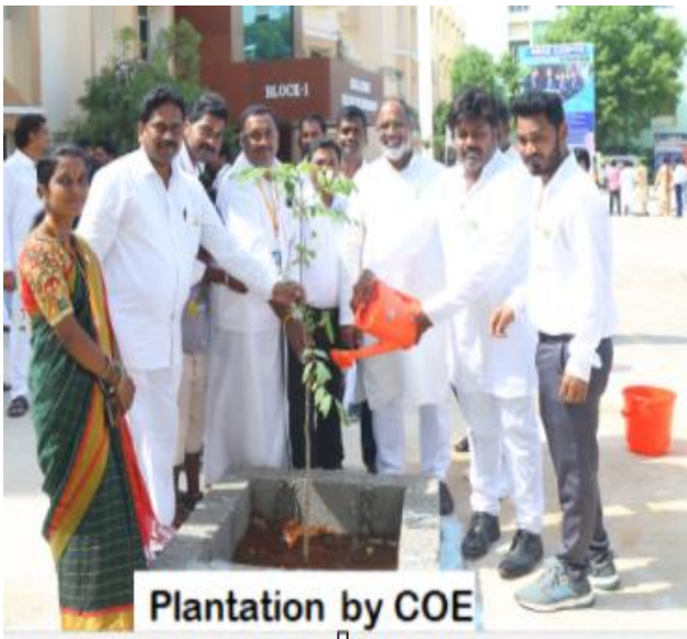
Plantation by COE