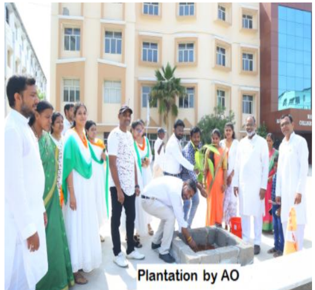
Plantation by AO