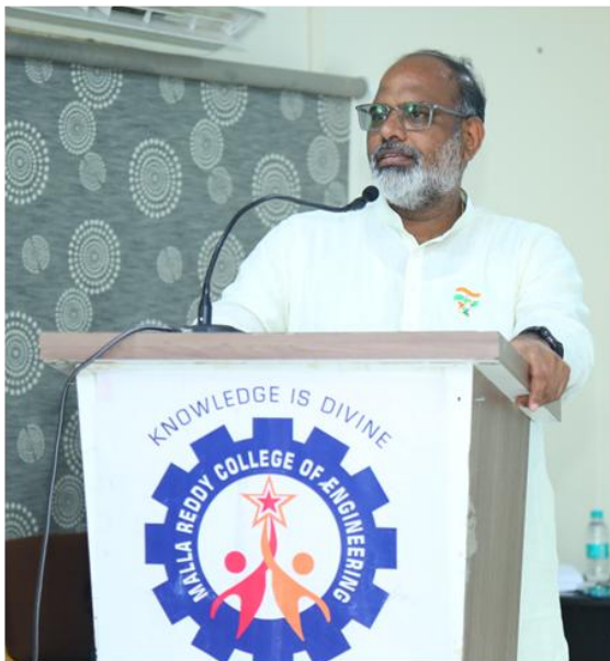
Address by Principal

Principal addressed in his speech that the theme for this year, " Viksit Bharat,' which translates to 'Developed India' " underscores the importance of embracing our diverse backgrounds and working collectively towards national growth. It is minimum responsibility of every citizen to know about our Constitution of India and Jurisdiction. Our Indian culture should develop from borrowed knowledge to creative knowledge which used to betterment of human kind. We should give equal importance to nature and technology; otherwise our country will face nature calamities like Kerala floods etc. The food habits also to be changed to build our country as a strong nation. The Government initiated to establish Indian Knowledge System Cell in every institute to improve startups culture by our young minds and contribution towards " Viksit Bharat " by 100th independence in 2047. In this connection, our institute established IIC centre to encourage our students having innovative ideas to transform into new products and services for the betterment of the society.