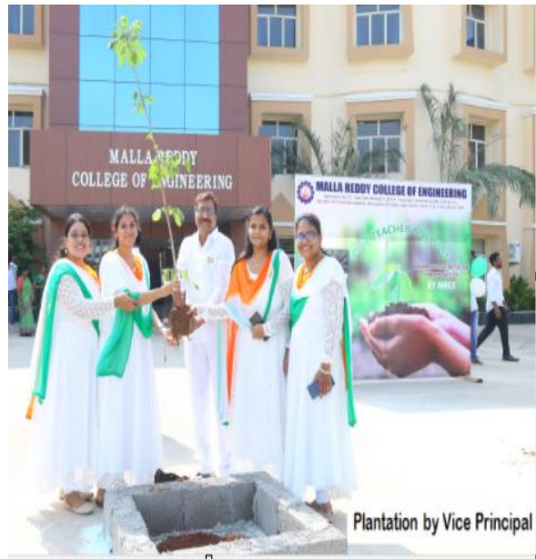
Plantation by Vice Principal