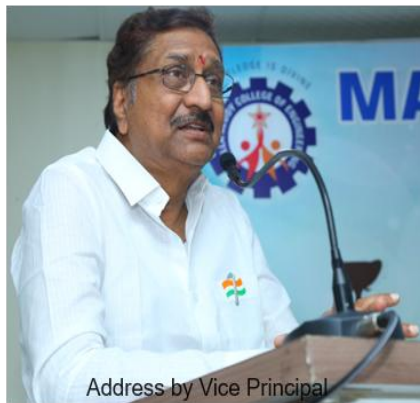
Address by Vice Principal

Vice principal addressed in his speech that it is our minimum duty to pay our respectable homage to freedom fighters on this day. Every citizen of India must fight against evils like corruption, terrorism, casteism and selfish politics.