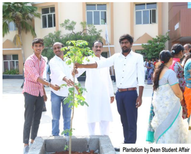
Plantation by Dean Student Affairs