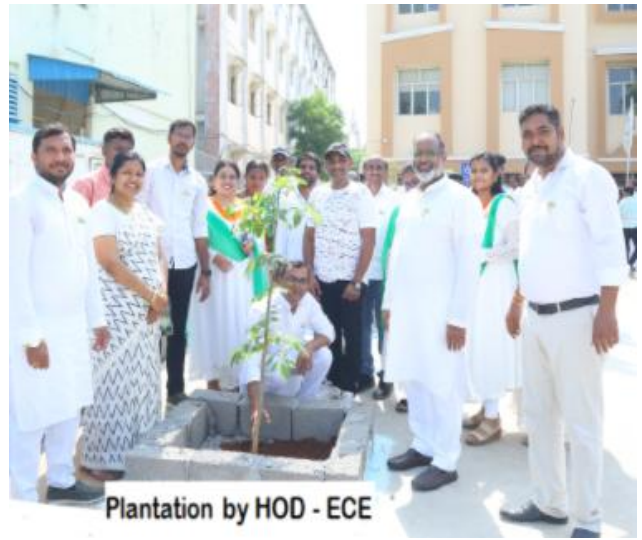
Plantation by HOD - ECE