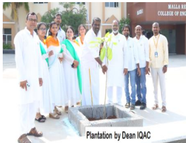
Plantation by Dean IQAC