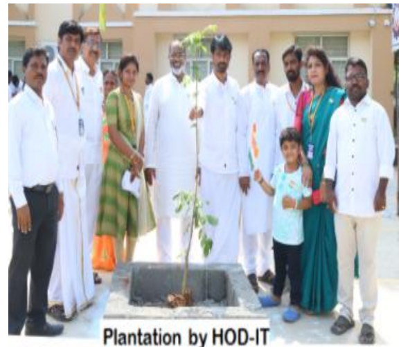
Plantation by HOD-IT