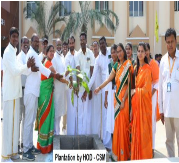
Plantation by HOD - CSM