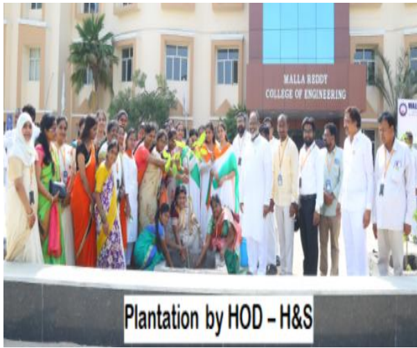
Plantation by HOD - H&S