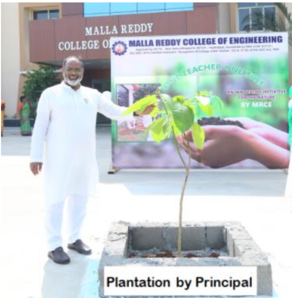
Plantation by Principal